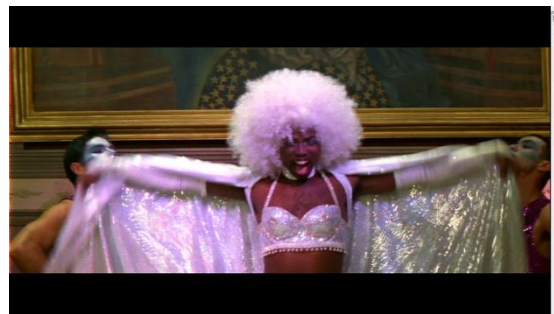
Fig. 4. Performing Young Heart (23:27 screengrab)