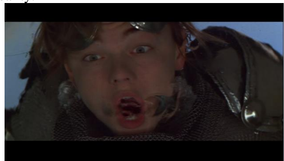
Fig. 2. Romeo clearing his head (24:26 screengrab)

The close-up focusing on her eyes and the perspective one gets when looking through water, separating two sequences in which the camera rushes to present the Capulets' preparations for the ball, reinforce the two opposing worlds. The following sequence brings Juliet into her mother's chamber and the exchange of retorts between the two is centred on the same syntactic chain. While describing Paris's beauty as "written in the margin of his eyes" and "in many's eyes" sharing "the glory" (I.3.87, 92), Lady Capulet reveals the real purpose of the ball when asking Juliet whether she