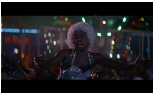
Fig. 3. Driven to the ball (22:57 screengrab)